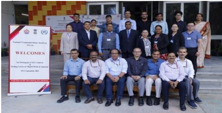
Pic: Participants of Int'l course for the member countries of APT

Ten participants from 9 countries participated in the international course on 'Digital Divide and Solutions' organized in physical mode during 9-13 September under the aegis of the Asia Pacific Tele-community (APT).