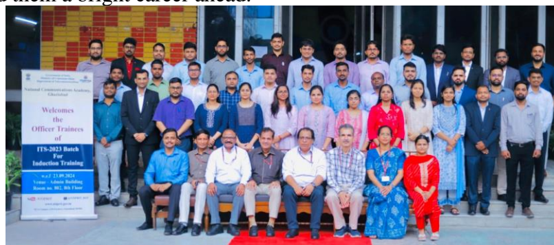
Pic. OTs of ITS 2023