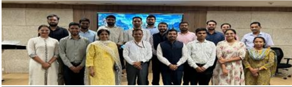
Pic. OTs of ITS 2021-22 at TRAI