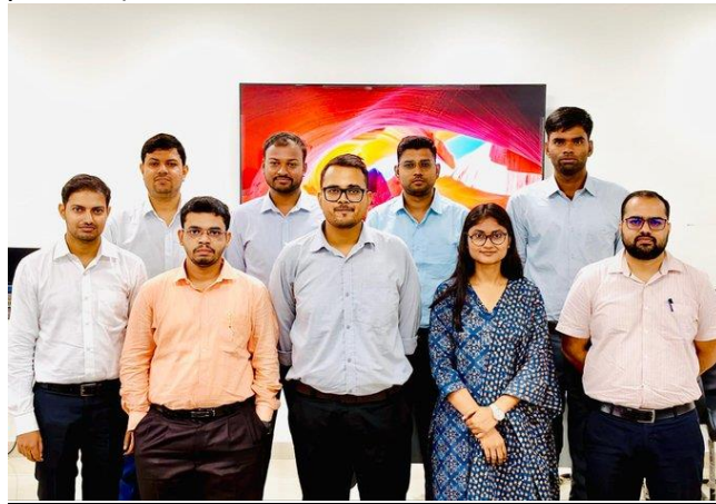
Pic. OTs of JTO 2023