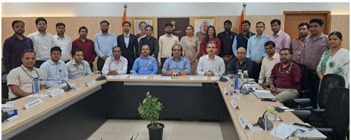
Pic- Fifth batch on 9 April