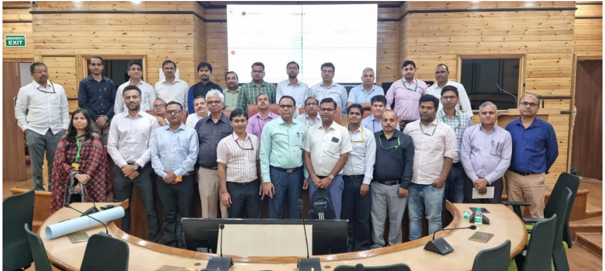
Pic- Third batch on 4 April