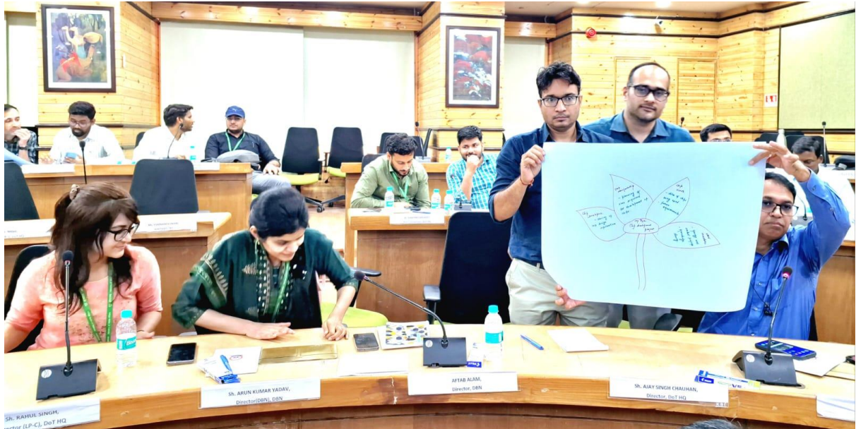
Pic- Sixth Batch on 30 April