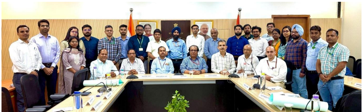
Pic- Fourth batch on 8 April